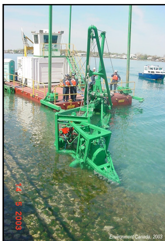
Hydraulic dredging was used in the 2004 sediment clean-up by Dow Chemical Canada. A hydraulic dredge works like a vacuum. Sediment is drawn through a hose to a processing area where it is treated and disposed of in an appropriate manner.