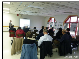
A number of open houses and consultations were conducted in 2012 and 2013 to gauge community preference on how best to remediate the contaminated sediment.