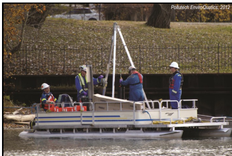
Environment Canada, the Ontario Ministry of the Environment and the St. Clair Region Conservation Authority hired experts to conduct chemical, biological and physical studies to delineate areas of contaminated sediment in the St. Clair River.